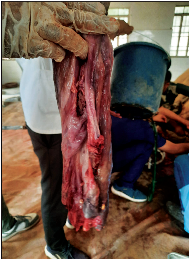
Fig 4. Gangrenous soft palate.