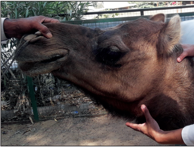
Fig 1. Swelling and pain on palpation and while straightening of neck.

Dulaa gets injured with its own teeth, biting of other camel and by external trauma (Gahlot, 2000 and Tanwar et al , 2016). Injury occurs commonly during rut season and injured dullla either hangs out or remain entrapped in situ . The affected animals usually show discomfort when swallowing, dysphagia, dyspnoea and are unable to extrude the dulaa due to lacerated wounds, gangrene, ulcers, abscesses or impaction with feed material (Ramadan, 2013). In animals of present study, dysphagia, dyspnoea and pain on palpation at throat region and while