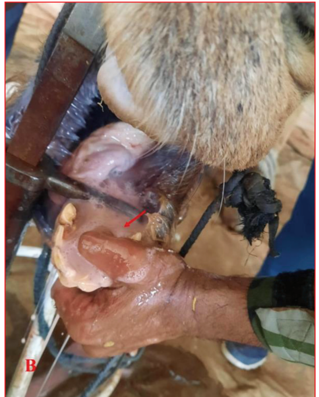
Fig 2B. Pus drained into oral cavity.