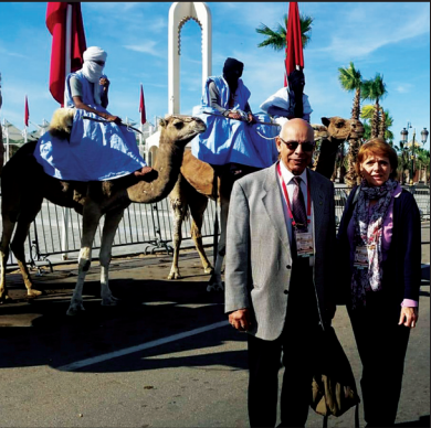
Fig 5. Camel Farm in Kazaghstan (left) & Tawareq on camels, Morrocco (right).