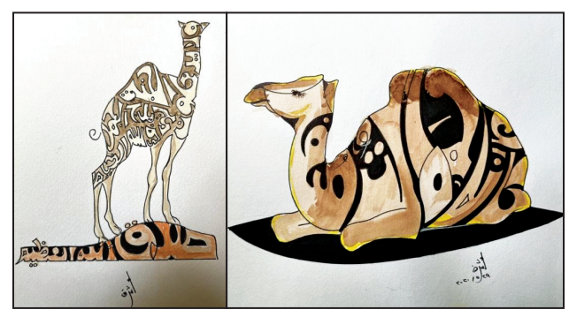
Fig 2. Arabic Calligraphy (one of my hobbies) drawing camels in a sitting and standing position. (By A.S. Saber, 2020).